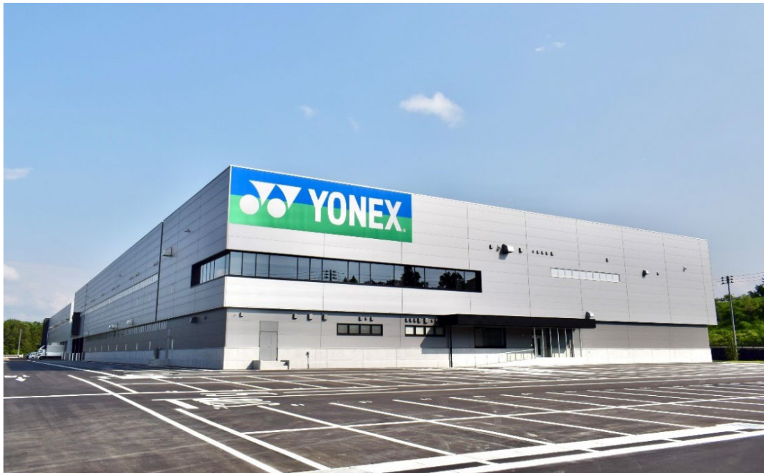
New Tennis Racquet Factory

TOKYO, Japan – Yonex Co., Ltd. (hereinafter referred to as “Yonex”) is pleased to announce the completion of a new tennis racquet factory on June 4, located on the same site as the existing factory and the Yonex Performance Innovation Center (Blue Lab), the research and development facility that began operations in July last year in Nagaoka City, Niigata Prefecture. The factory is scheduled to start operations in December of the same year. Yonex will meet the increasing global demands in volume by cooperating with Yonex Performance Innovation Center (Blue Lab) and will deliver Made by Yonex high-quality products to support players at all levels.